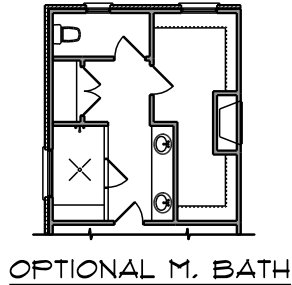
OPTIONAL M. BATH